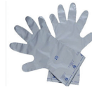
North SilverShield Gloves & Sleeves (QNORSSG6)