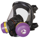
North 7600 (760008A)