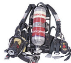
Titan SCBA (995144)