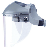
N400 Faceshield (F500)