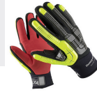
Rig Dog (MPCT2000)