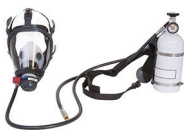
Panther Hip-Pac (P968500)