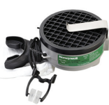
Mouthbit Escape Respirator (7902)