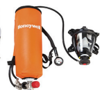
BA1000 Compliance SCBA (BA1000)