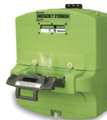
Fendall Pure Flow 1000 Eyewash Station (32-001000-0000)